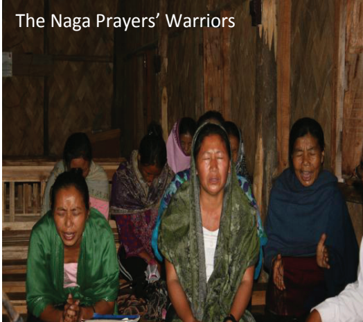
The Naga Prayers' Warriors